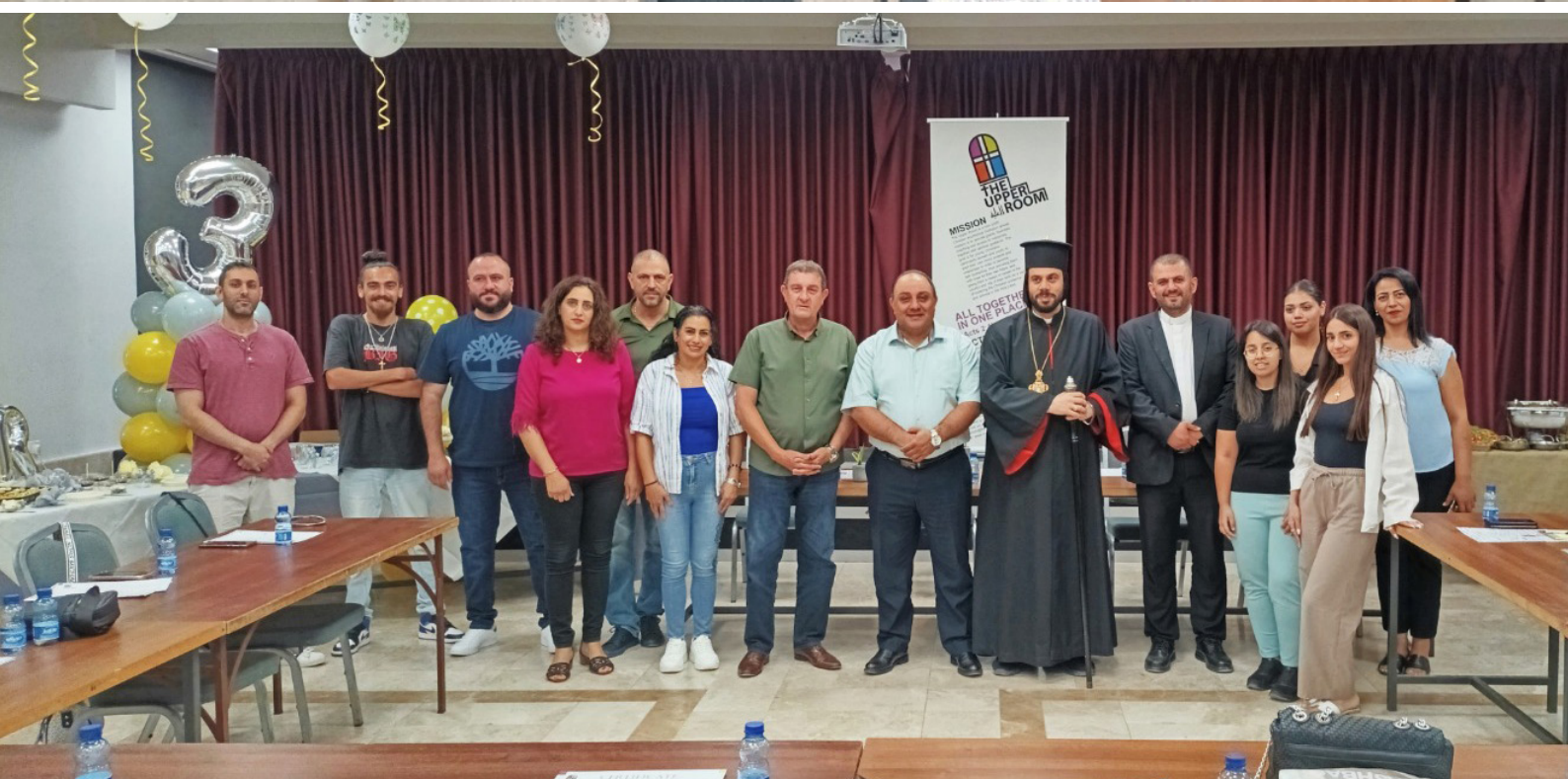
The 3rd training courses: 6 training sessions from 10 June – 6 September 2024