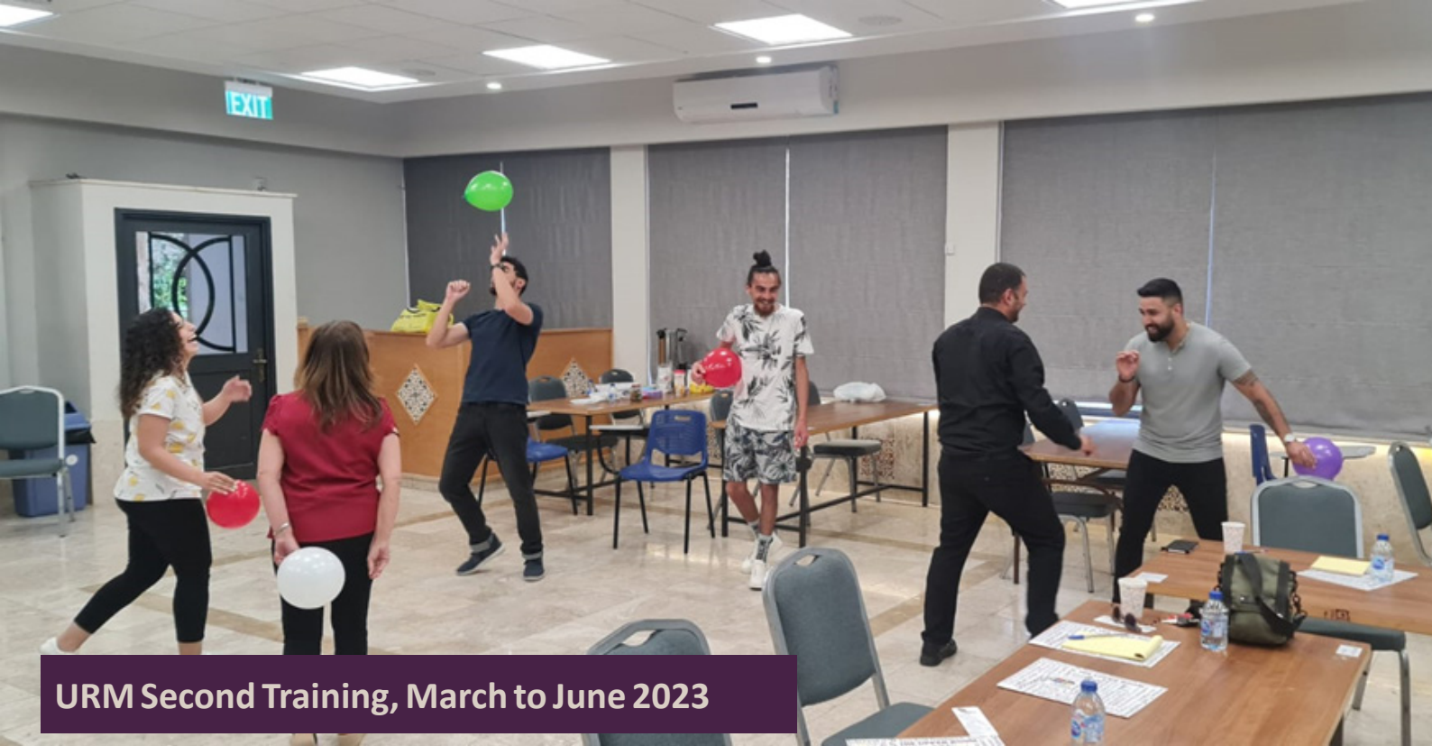
URM Second Training, March to June 2023